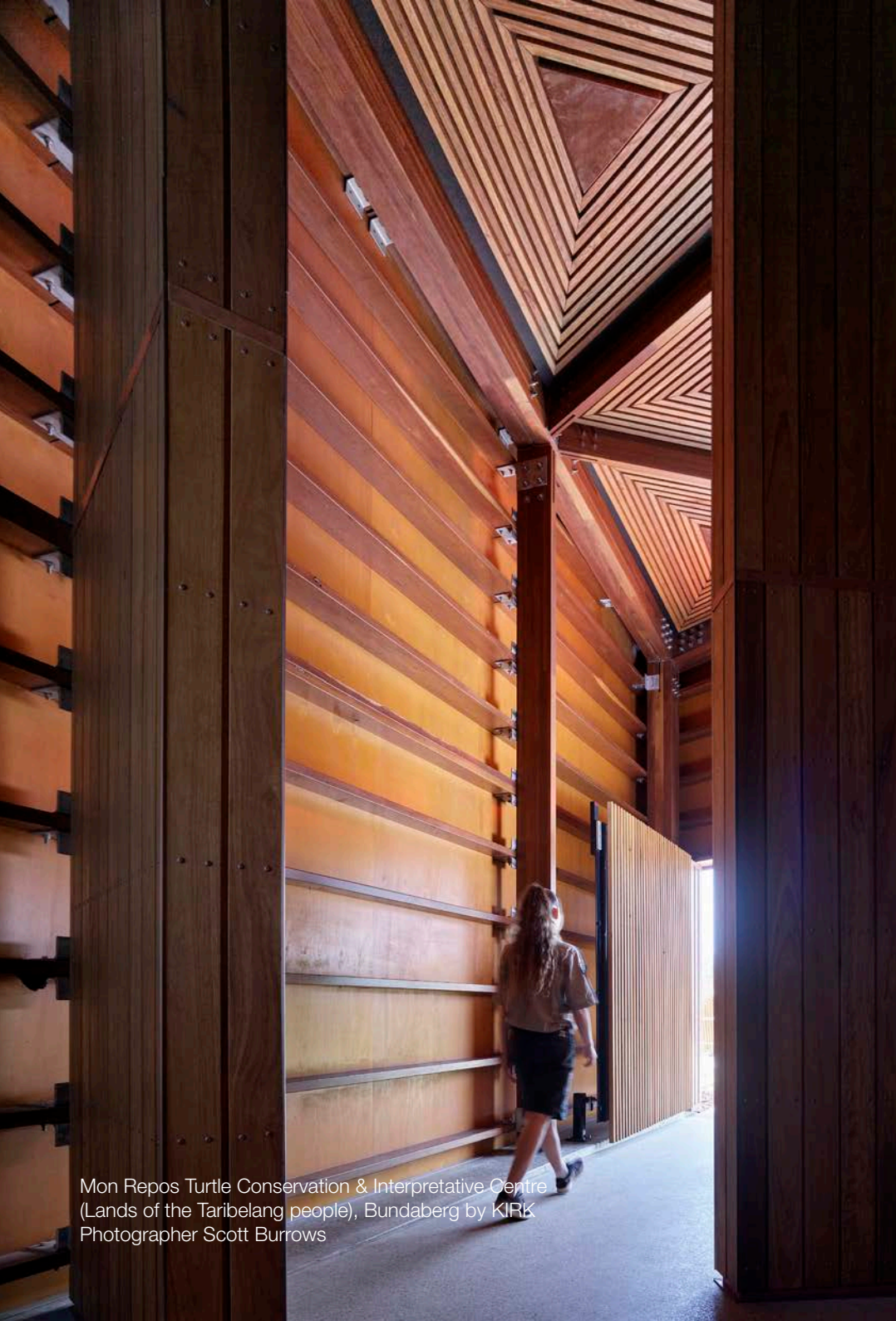
Mon Repos Turtle Conservation & Interpretative Centre (Lands of the Taribelang people), Bundaberg by KIRK Photographer Scott Burrows