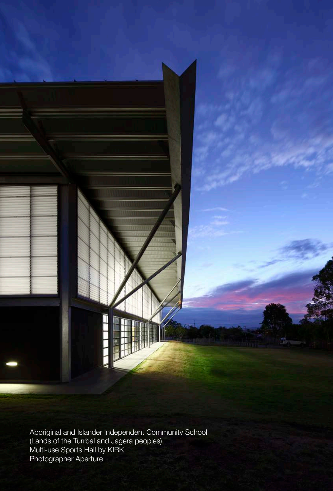
Aboriginal and Islander Independent Community School (Lands of the Turrbal and Jagera peoples) Multi-use Sports Hall by KIRK