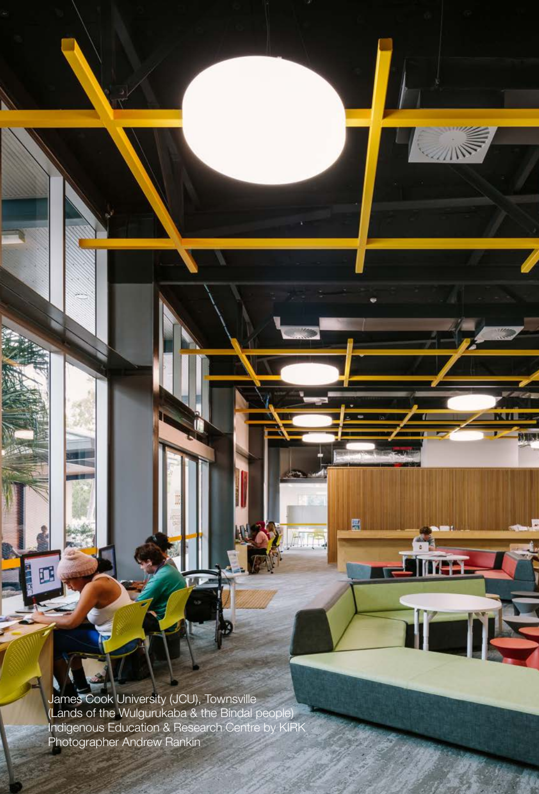
James Cook University (JCU), Townsville (Lands of the Wulgurukaba & the Bindal people) Indigenous Education & Research Centre by KIRK