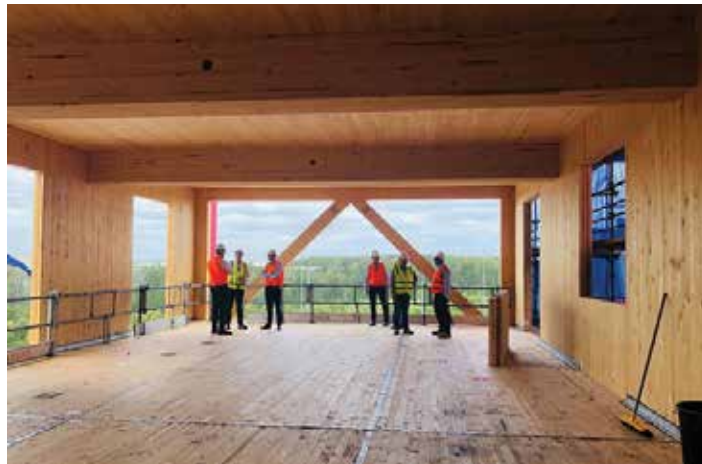
Fast, clean build... the new NIOA building is expected to be completed in April.