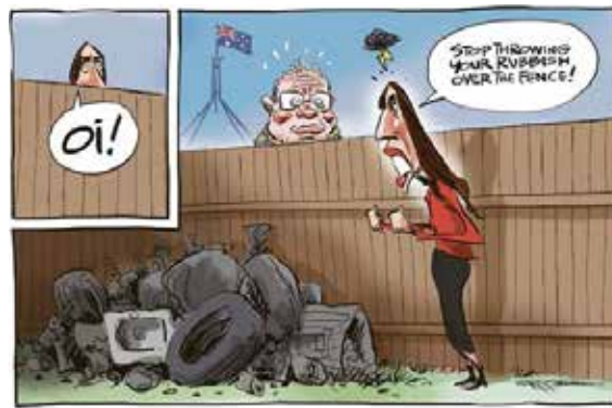
(Rod Emmerson NZ Herald)

The government, and especially Prime Minister Ardern, are now panicking. 'Loan-to-value ratios (LVRs)