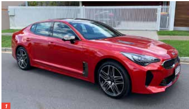
1/ Kia's MY21 Stinger... it's all about the journey.