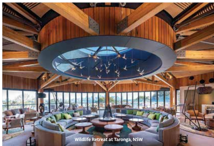
Wildlife Retreat at Taronga, NSW

In parts of NSW more than three-quarters of remaining rainforests were burnt.