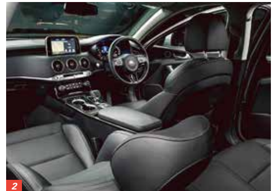
2/ Inside the Stinger... black leather and a host of new additions.

edged dynamics and brutal styling all at the expense of luxury, comfort and grace. The Stinger has nothing to do with being the first to arrive at the destination – this car is all about the journey."