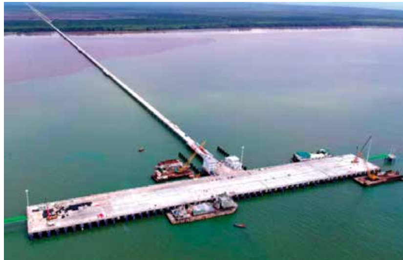
New port terminal at the world's largest pulpmill... the OKI operation in Sumatra, Indonesia, designed for pulp and paper exports, but possibly also for importing woodchips.