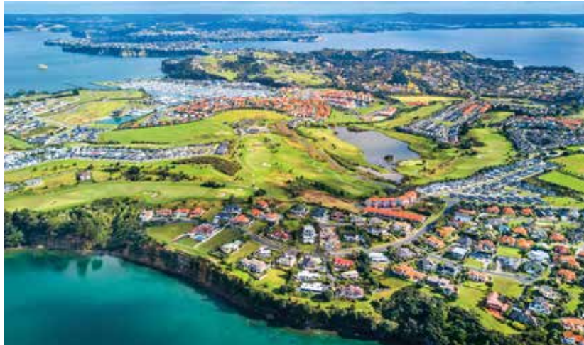
Housing hot... price records topple in New Zealand.

“THE MARKET WILL KEEP RUNNING HOT THIS YEAR”