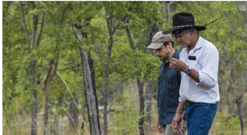
Thaypan people... traditional owners of more than 38,000 ha of land in central Cape York.

Dead finish is 'timber gold' for the Chinese; the dense red hard timber cut to size from small trees, some of which