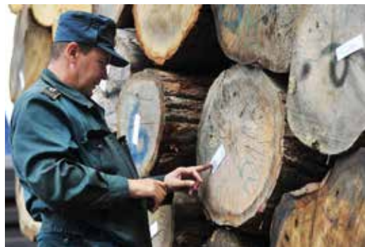
Russian official checks logs for export.

The Chinese lumber industry will be directly impacted in the short-term as exports of softwood logs