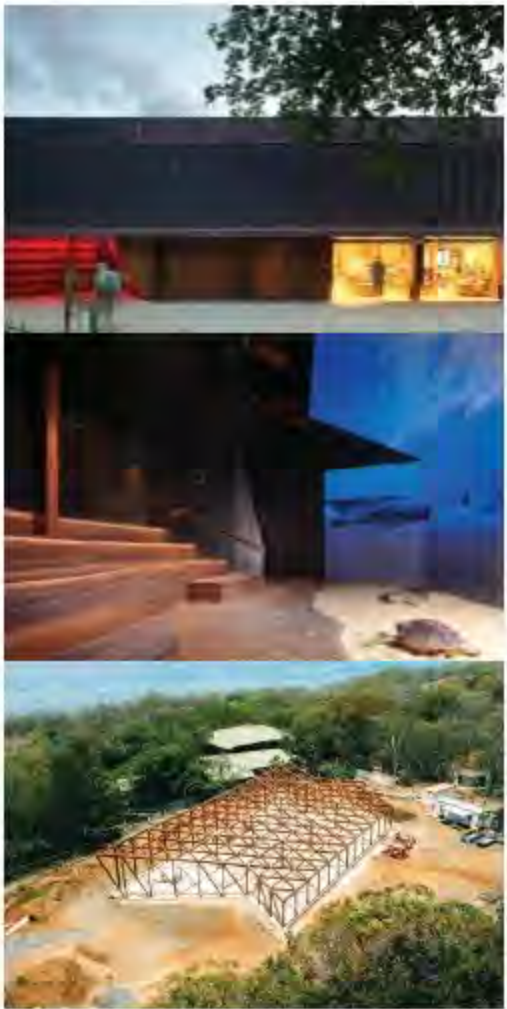
The engineered gluelaminated frame was manufactured off-site in Maryborough for rapid on-site assembly.

The materially conservative, environmentally efficient and technically expressive approach taken by the architect sidestepped expectations that the building would “look like a turtle centre.” Richard Kirk observes that there was no precedent for that, just as there was no precedent for a naturally ventilated building with zero light spill. Instead, inspired by the practicality of much rural and regional building, the centre demonstrates a precise and poetic mastery of function and technique that is at once solemn and mysterious, generous and adaptable: an inventively restrained distillation of requirements into an elegantly resilient architecture for research, wildlife support and public education. Through the ancient cycle of birth and re-