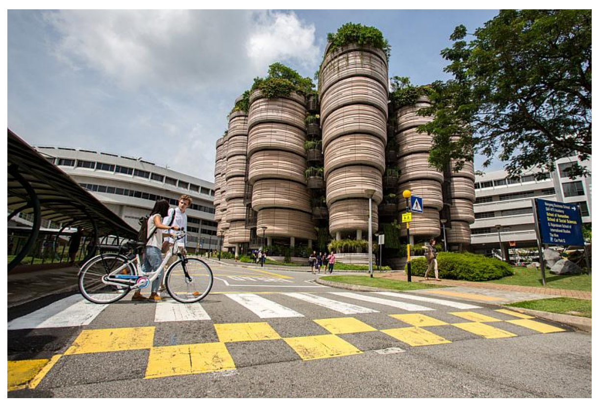
NTU's first learning hub, The Hive, which was launched in 2015.

The Arc is NTU's second learning hub, after its first, The Hive, was launched in 2015. The Hive, which has been nicknamed the "dim sum basket building", has another 55 smart classrooms with similar features.