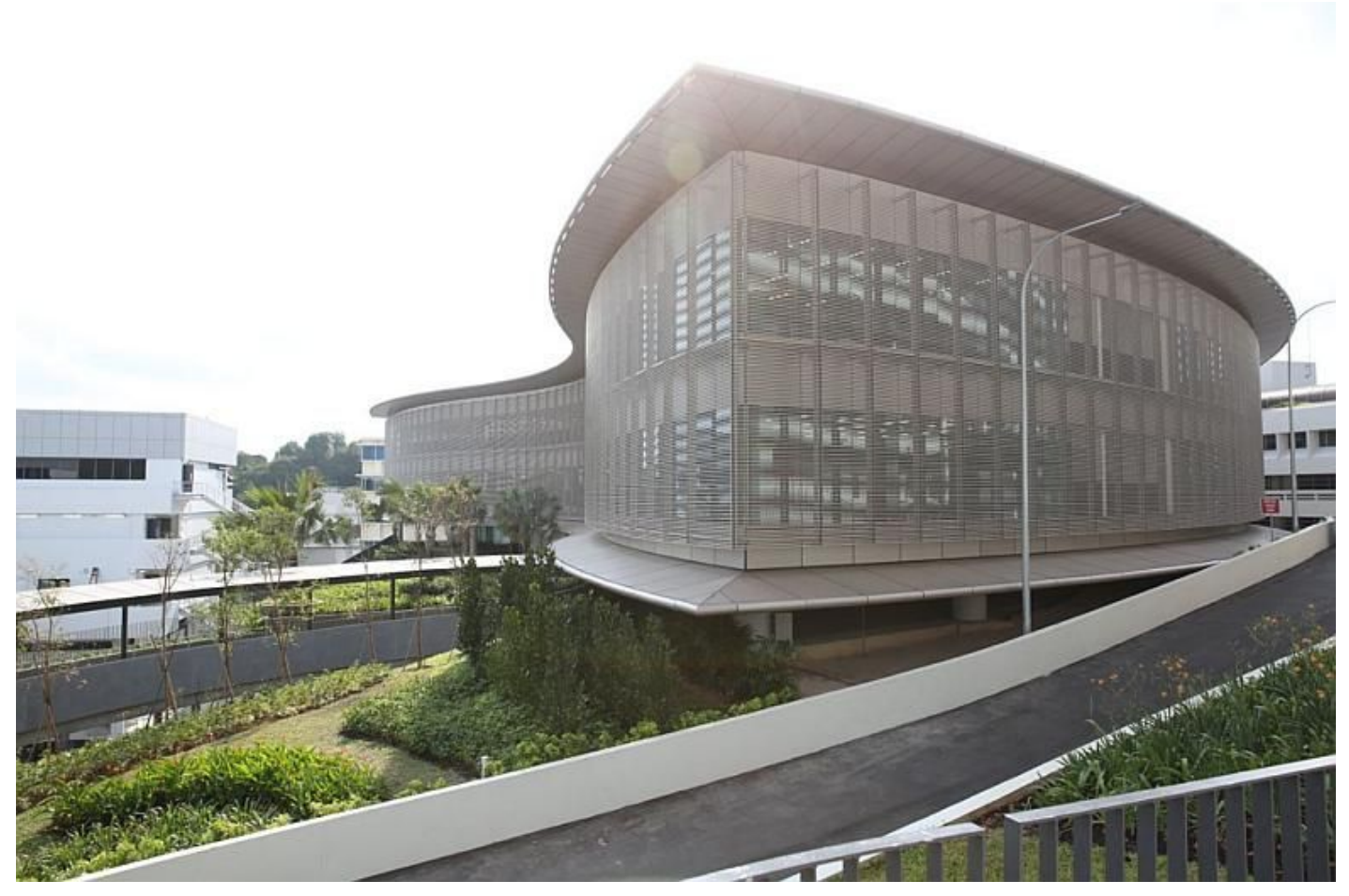
NTU has launched its latest learning hub, The Arc, a six-storey building with 56 smart classrooms.