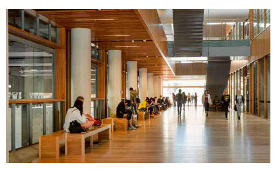
Live building data is gathered by the BMCS and displayed on screens across the facility.

"As a previous student of mechanical engineering at the University of Queensland, I believe this new engineering building will contribute in providing exposure of our industry to new students who may then become prospective professionals of HVAC."