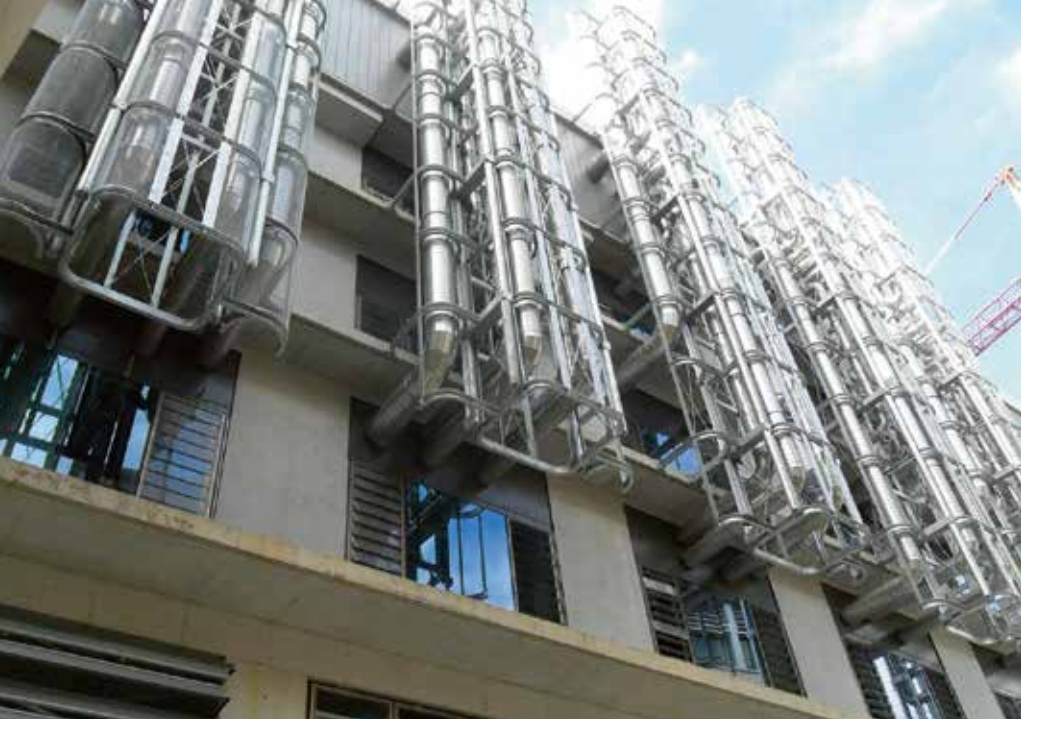
External ductwork risers contain various ventilation ducts that reticulate between plant rooms. They also provide shading for laboratories.

"The balance of system and aesthetics has worked well, with the super studio performing to a high level of comfort."