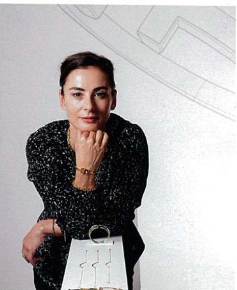
70 Tiffany's new design diva, Francesca Amfitheatrof