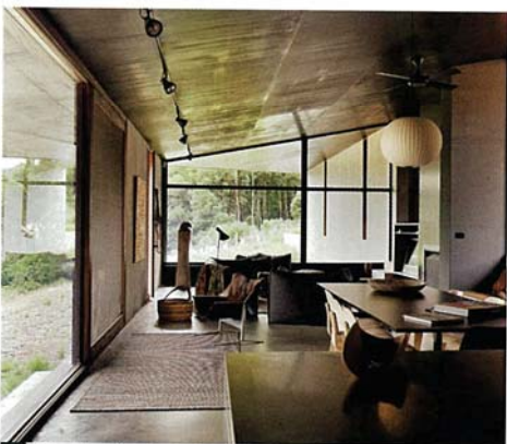
48 The Hanging Rock house has views on every side