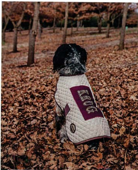
84 Jo, the scruffy truffle dog, in a Krug-branded jacket