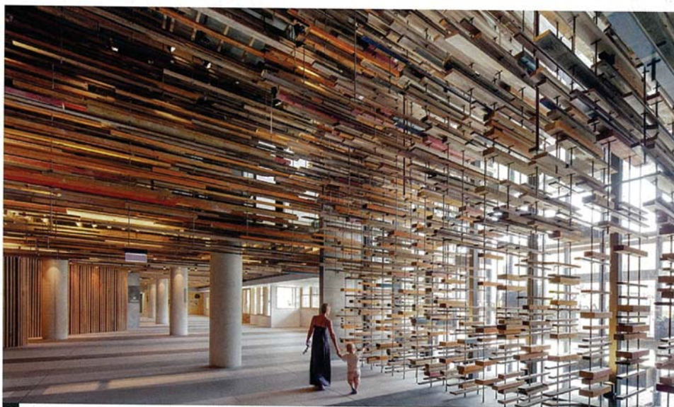
34 Hotel Hotel in Canberra, with its grand timber installation, has won a National Award for Interior Architecture