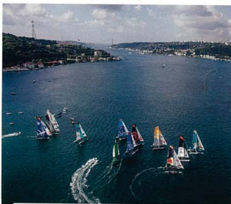
88 A flotilla of Extreme 40s on the Bosphorus, Istanbul