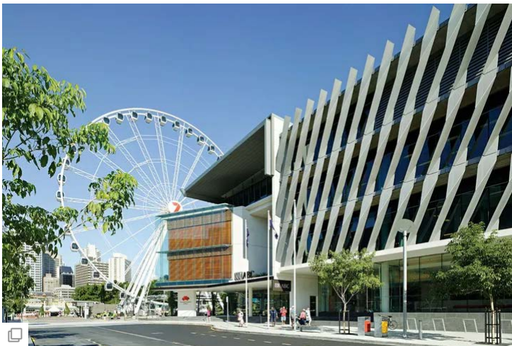
A two-storey glazed box cantilevered over Russell Street.

Expression of the nature and function of the internal spaces is sublimated by enclosing each of the floors in independent planes of modular, floor-to-ceiling glazing. Heat and glare on the parklands elevation are controlled by automated and programmable external aluminium blinds, which provide a measure of transparency to and from the parklands even when fully deployed. In contrast, the elevations to Russell and Grey Streets are shaded and screened by a visually lively yet static array of folded, coated steel blades. The rhythmic, sculptural geometry of the twisted and folded planar elements of the screen animates the two street elevations.