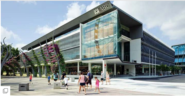
The rectilinear building contrasts with the curved arbour.