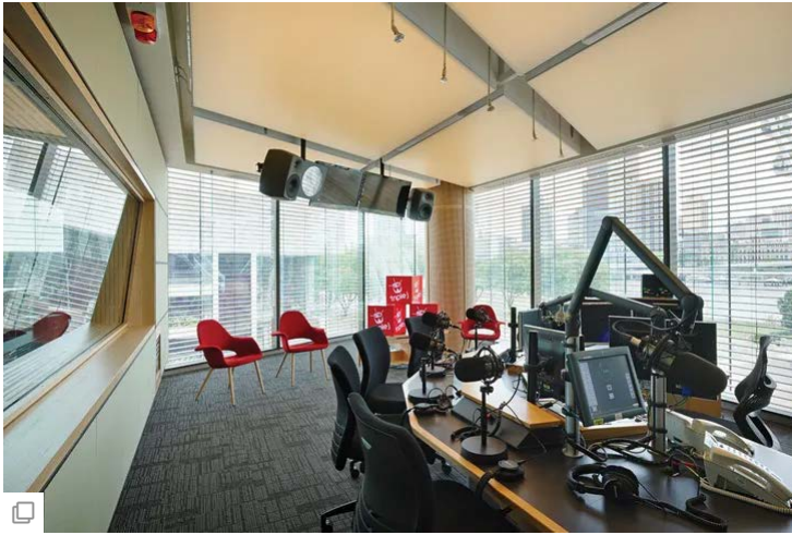
The radio broadcast studios cantilevered out over Russell Street.