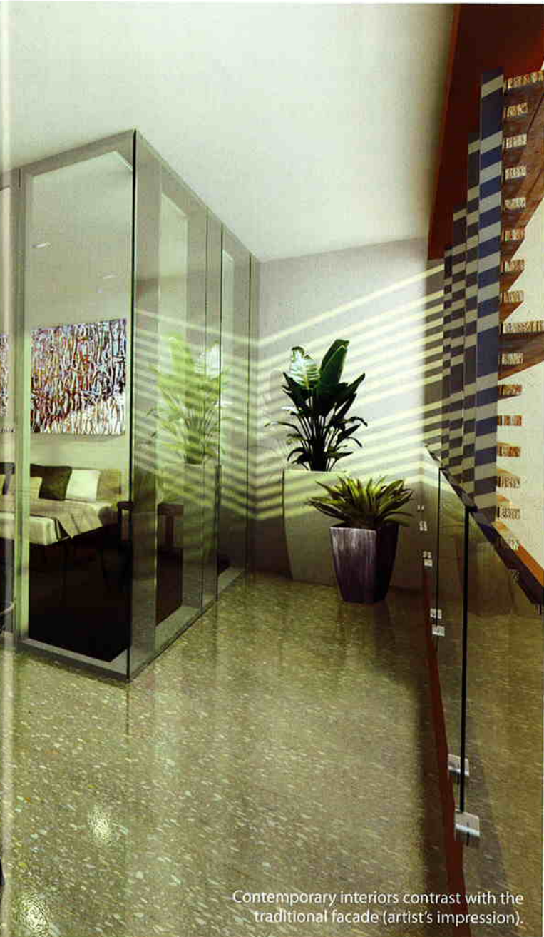
Contemporary interiors contrast with the traditional facade (artist's impression).