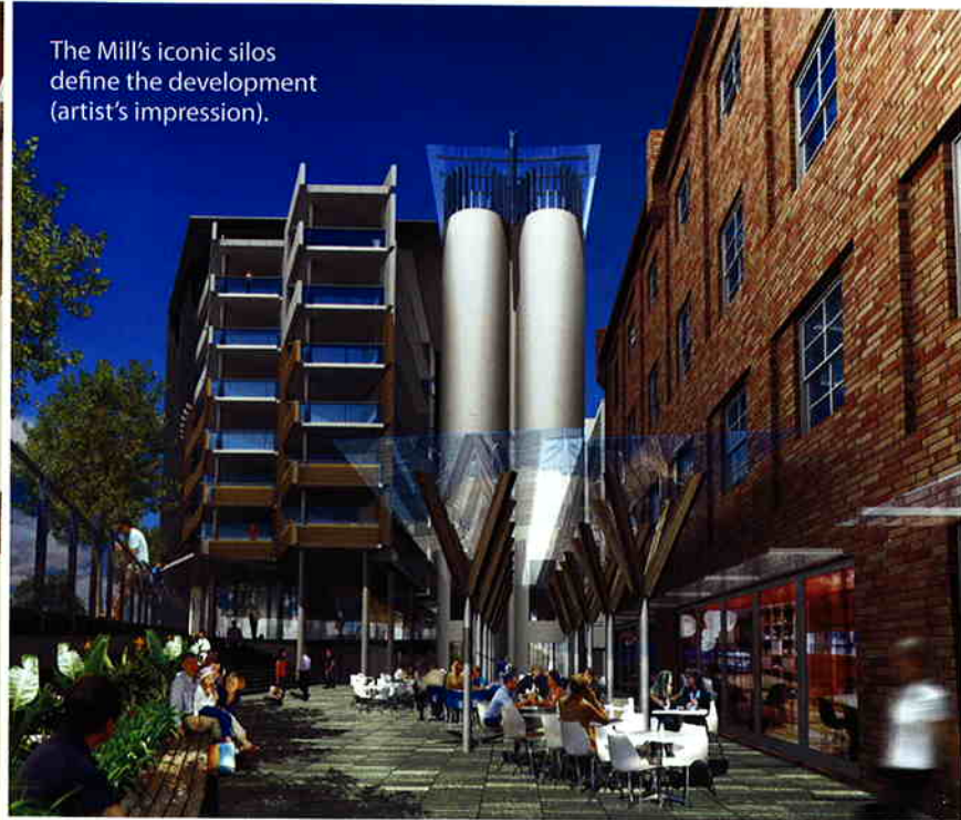
The Mill's iconic silos define the development (artist's impression).