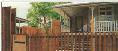
Top left: window to the trees Top: the elaborate timber staircase Above: a modern fence surrounds the home