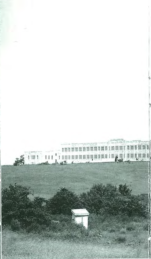
Bus Stop 1950s