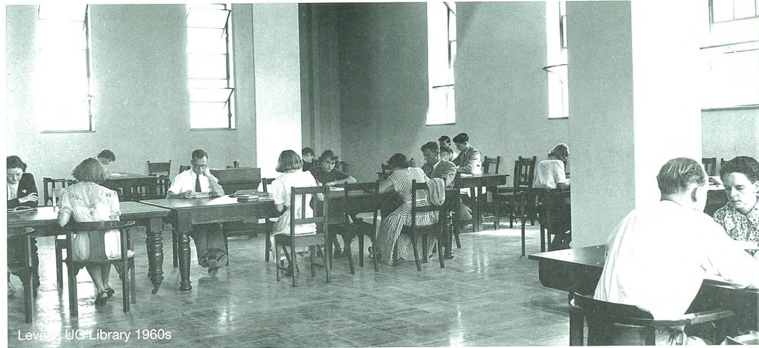
Level 2 UG Library 1960s

Economics was the first business related discipline taught at UQ and degree level Commerce programs were originally offered in 1926 with the MBA program in 1972. The Faculty of Commerce was established in 1925, with the Department of Accounting (which became Commerce) formed in 1961. The Department of Business Administration (which became Management) was created in 1972 and in 2002 the Departments of Commerce and Management merged to form UQ Business School.