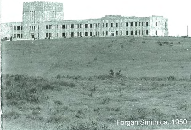
Forgan Smith ca. 1950

The University of Queensland (UQ) is one of Australia's premier learning and research institutions. It is the oldest university in Queensland and has produced almost 197,000 graduates since opening in 1911. UQ has a long and proud history in the teaching of business, commerce and management. UQ has produced, and continues to produce, some of Australia's most successful business leaders.